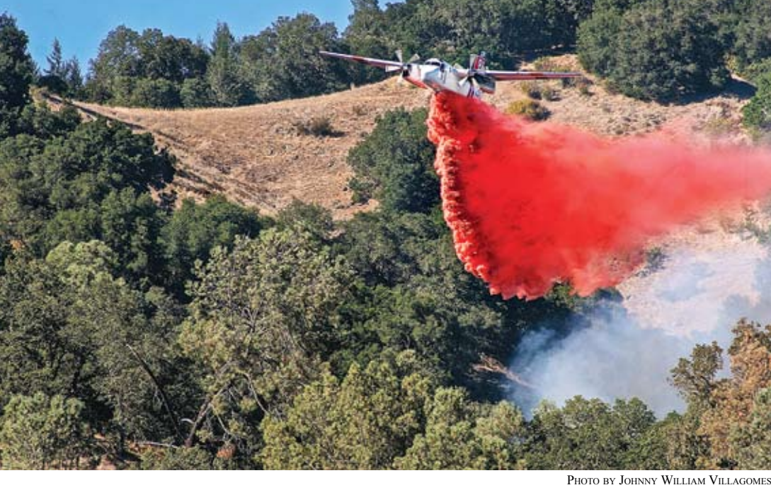
A Cal Fire plane dumps retardant on a fire that erupted off the Oat Hill Mine Road Trail last Thursday and burned a half acre before being extinguished by fire personnel.

Oat Hill Mine Road Trail are being questioned over their possible involvement in a half-acre hillside brush fire last week