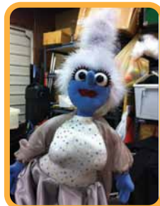
Fairy Humane Mother