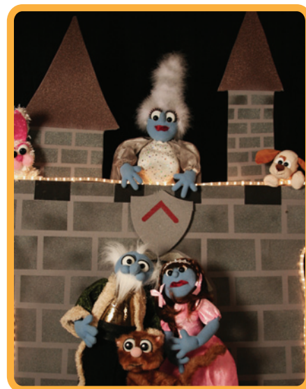
The Cast of Napa Humane's "The Right Pet For Princess Penny"