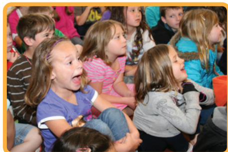
Students at Mt. George Elementary School enjoy a Performance