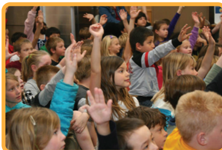
A Lively Q & A at Mt. George Elementary School After the Show