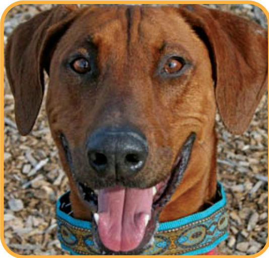
Binks (formerly Flapjack)