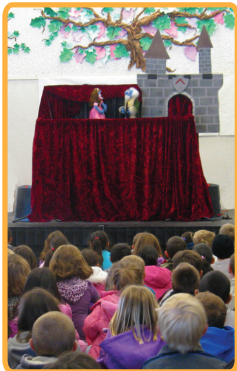
Puppet Art Theater in Action at West Park Elementary School, Napa