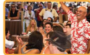
Live auction action

The Napa Valley is known for its generosity, but we are always blown away by the support we receive at the “Cause for the Paws” event held each summer for the past seven years.