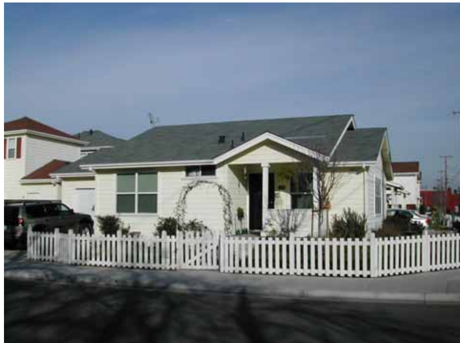
Deturk self-help housing developed by Burbank Housing provided new homes for 32 families in a convenient downtown Santa Rosa location.

There are many factors creating this problem that we can't do anything about. But there are also many that we can deal with to ease the crunch on those who can't afford today's high housing costs.