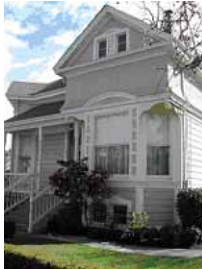
Sharpsteen house is a prime example of Victorian architecture in downtown Calistoga.

As the General Plan CAC looked into the future, one of the overriding concerns (as mentioned above) was how to keep the small town character of Calistoga, while at the same time addressing our housing need. Size is important to our community character, and we can take some comfort in the fact that Calistoga will always be a relatively small town. Even when fully developed a few decades from now, the population of Calistoga is not likely to exceed about seven thousand (it's now estimated at a little over five thousand). The City has no plans to expand its borders, and with the county agricultural preserve in place we are well protected from growth nearby.