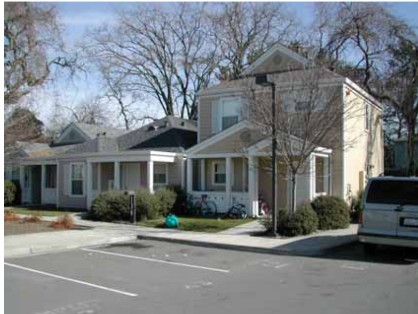
Lavelle Village, built by Burbank Housing in Santa Rosa, is a good example of subsidized family apartments

Calistoga cannot solve the world's (or California's or the Bay Area's) housing problems. We can, however, do our share to help make "A Place For Everyone."