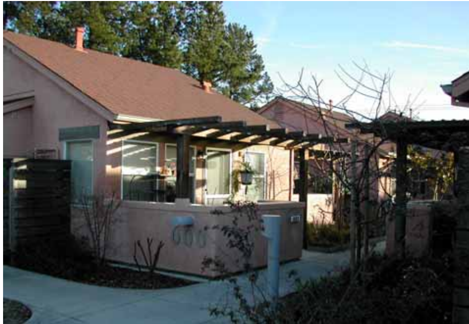
The Vinecrest senior apartments in Windsor are open to seniors who pay a maximum of 30% of their income to live there