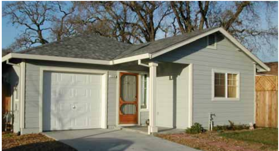
The Esmund Place “self-help” project by Burbank Housing is a good example of achieving affordability through sweat equity and favorable subsidized financing.